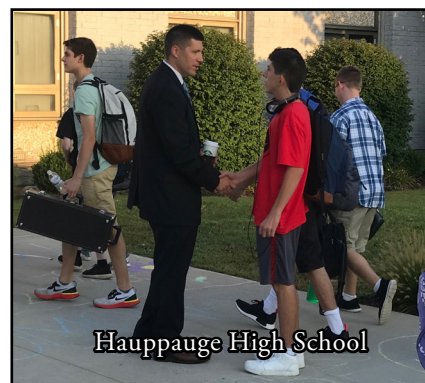
Hauppauge High School