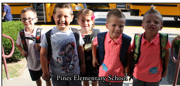
Pines Elementary School