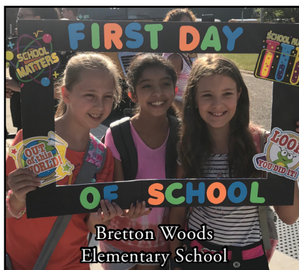
Bretton Woods Elementary School