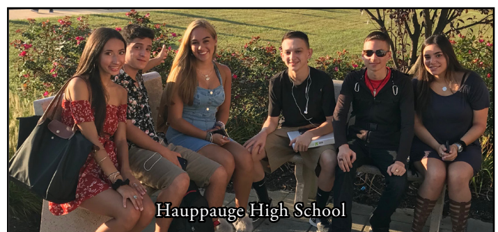
Hauppauge High School